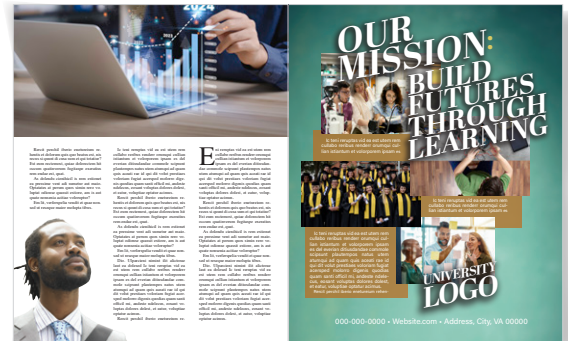
~ Sample editorial section with half-page and full-page ad placement ~